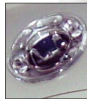
Optional Polycarbonate window with LED holder